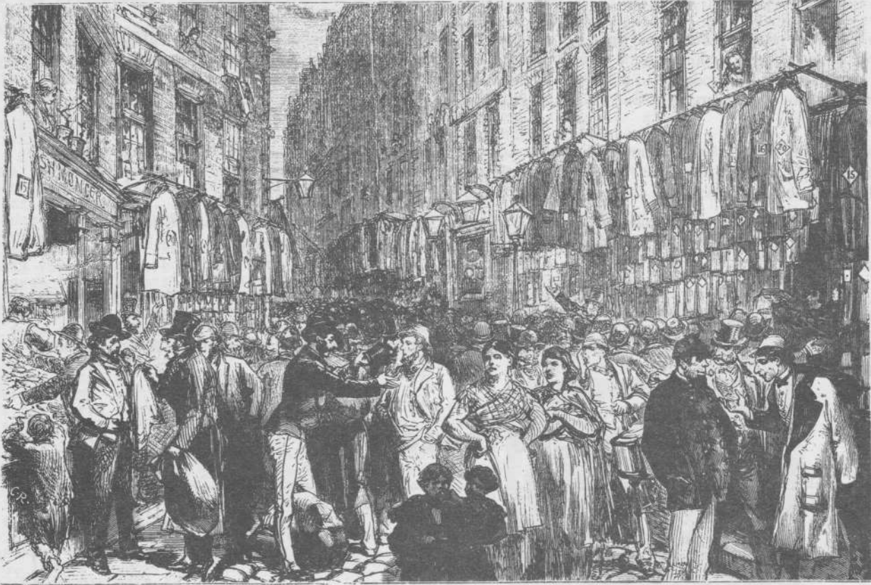
The above sketch is of Petticoat Lane, circa 1870, and is a panoply of the times. In the period of 1942-45, the Lane was the gathering place of everyone on Sunday mornings. Men in kiaki line the street and booths looking for the best buy of the week. Nowadays, the Lane is just another sight for the visitors to London. The old Petticoat Lane is dead.