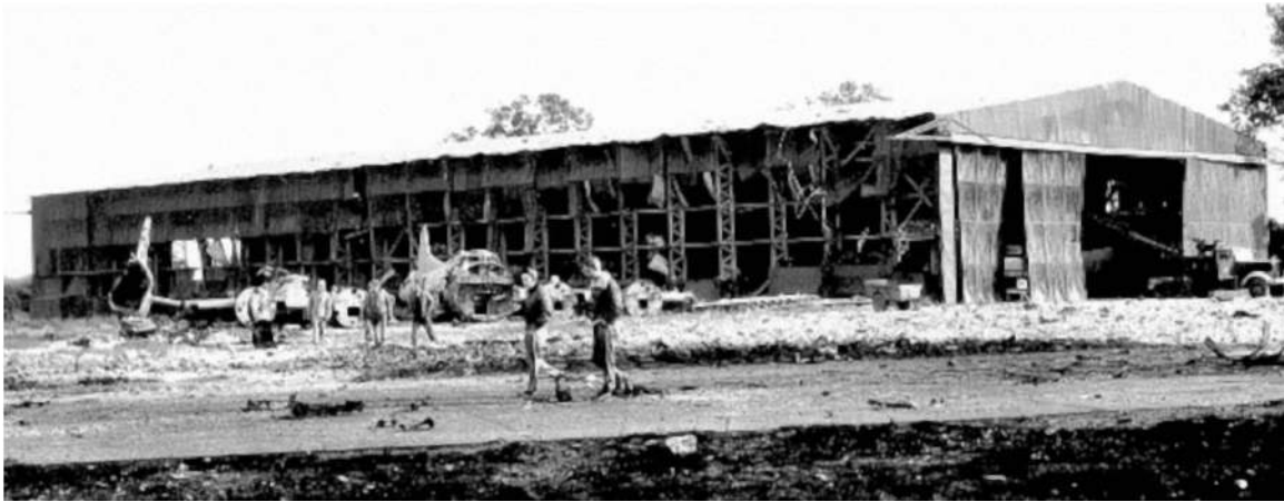
B-17 No. 42-30414, Round Trip Ticket II was destroyed by the fire and explosion

B-17 No. 42-5911, Hesitatin' Hussy , fully loaded for a mission, caught fire. The fire spread to the flares, gasoline and finally the bombs. Cpl. Edward B. DeWolf of the Fire Platoon was killed in the subsequent explosion. The explosion damaged most buildings at the flight line including the newly built hanger. Several nearby B-17s were destroyed and the mission for the day was scrubbed.