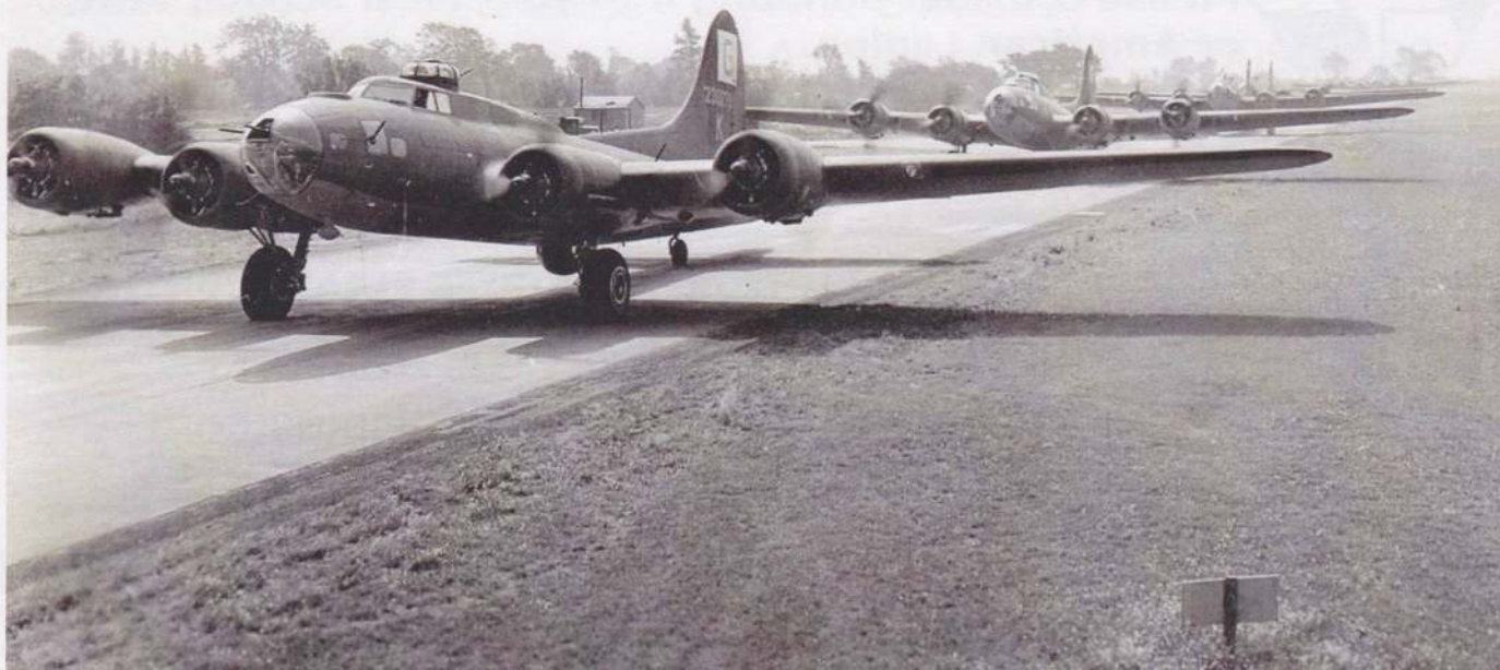
42-30279 "Black Jacker"