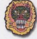
551 Bomb Squadron HR - Green