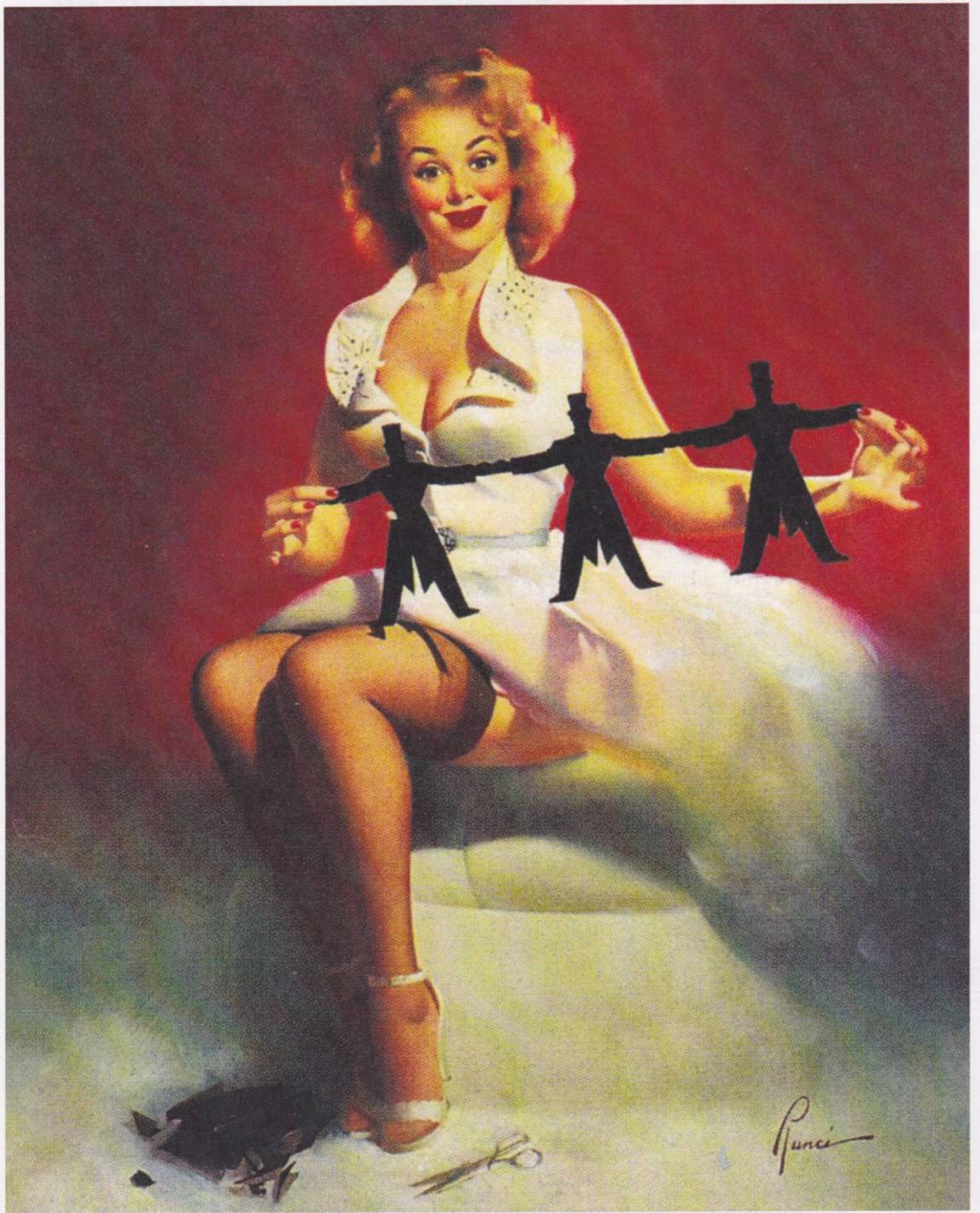
They're Easy To Handle - 1953